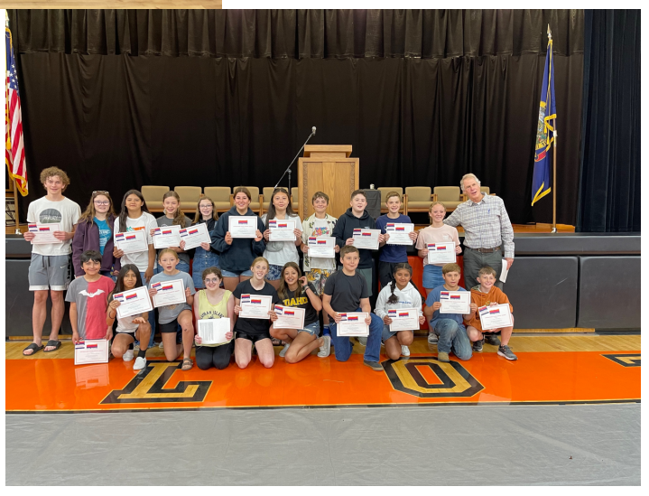
Wendell Scholarship Awards