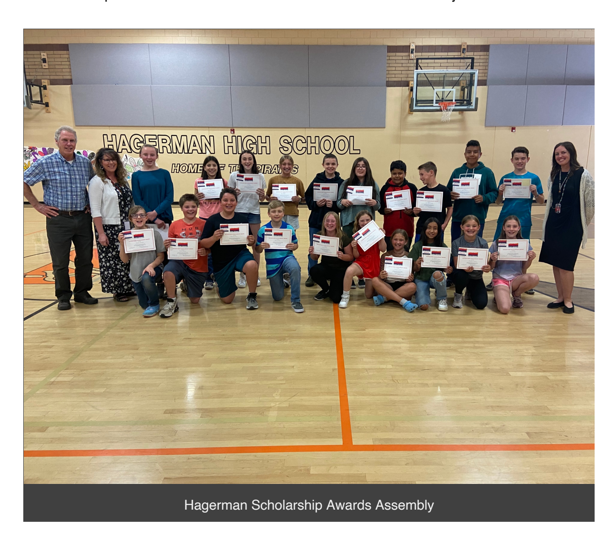
Sharing the Spirit of Support and Appreciation