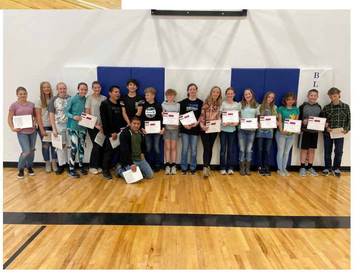
Camas Scholarship Awards